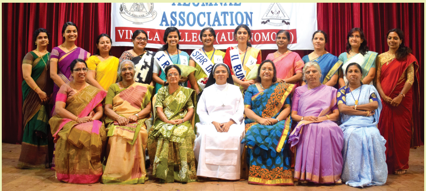
Alumnae Executive Committee with the Star of Vimala winners and judges

Star of Vimala: Contenders for the title are put through gruelling rounds involving an off-stage round having personal interview and certificate verification, and an on-stage round which includes self introduction, current awareness, JAM, situation round and problem solving.