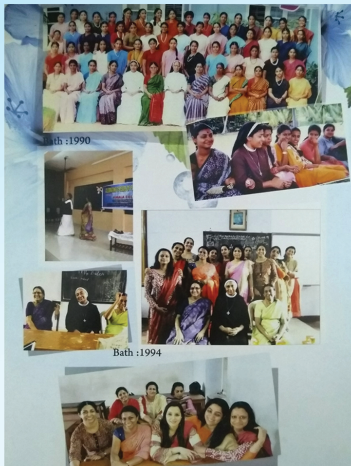
Collage of Various Reunion Moments of the Department of Sociology

The Vimala family is forever growing, with new members coming into the warm folds of Vimalamatha's loving embrace as students and teachers. What began as a dream to nurture the spark that our founding pioneers saw in young girls, stands proudly upon milestones set by the huge community of Vimalites more than half a century later. There is joy at being so many member-strong, there is pride at the successes brought home, but above and beyond these, there is gratitude for having had the opportunity to contribute towards shaping out complete individuals who are simple in their ways, charming in their associations, firm in their opinions and bold in their decisions. This community of women who walked over this campus, were trained within these corridors and were encouraged to blossom out to their full potential within these walls that offered love, security and motivation are the true embodiment of the spirit that Vimala offers and upholds. The Alumnae Association is privileged to play the role of the pivotal link between the yesterdays and today of Vimala. What then brings absolute delight are the warm reunions and bonds forged during meetings and joint initiatives that witness the birth of collective efforts towards building a bright tomorrow. We present before you, Dear Alumna 2018 . This is the space to articulate all that we wish the posterity to know. It is the legacy we leave behind for the torchbearers of the future.