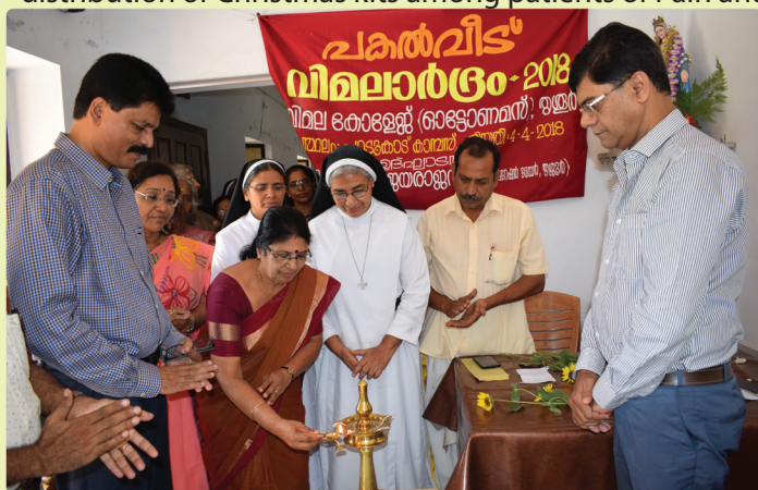
Mayor Inaugurates Pakalveedu