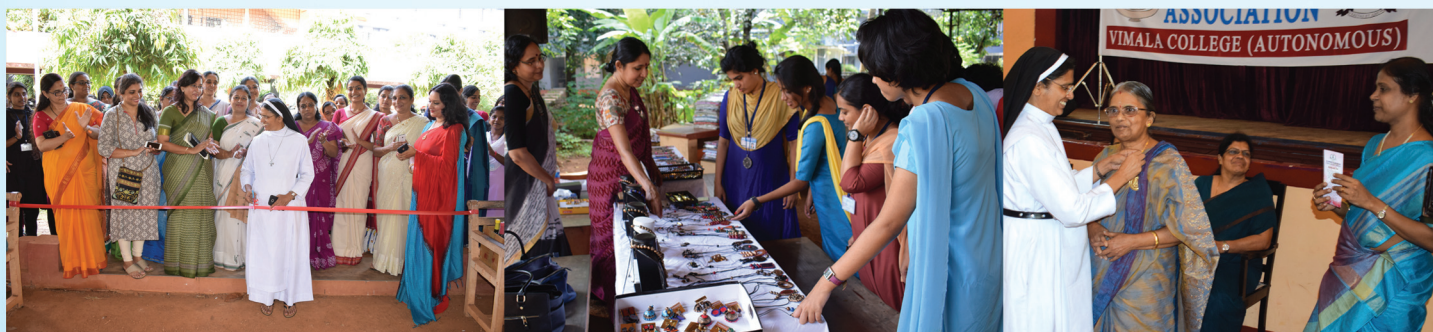
Alumnae Bazaar 13.10.2018