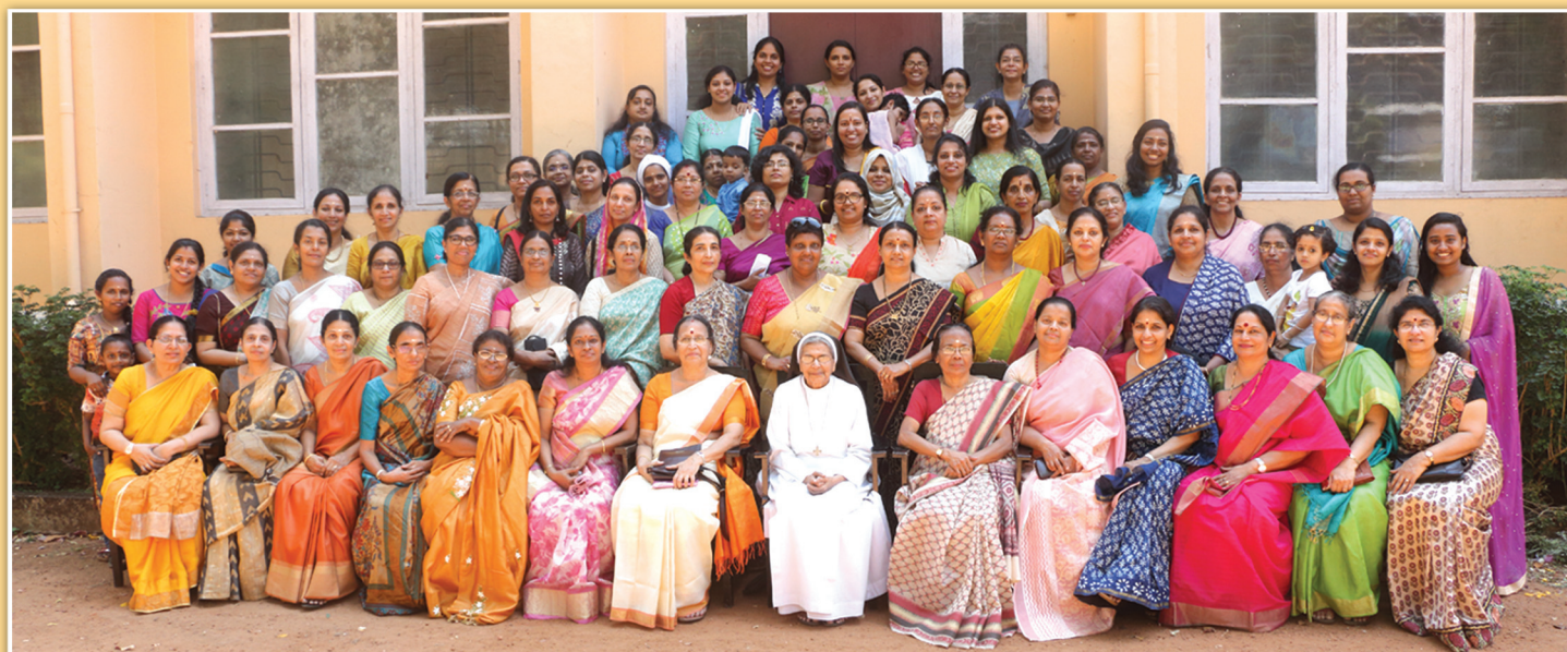
The Golden Jubilee Reunion Celebrations of the Department of Home Science in February 2018